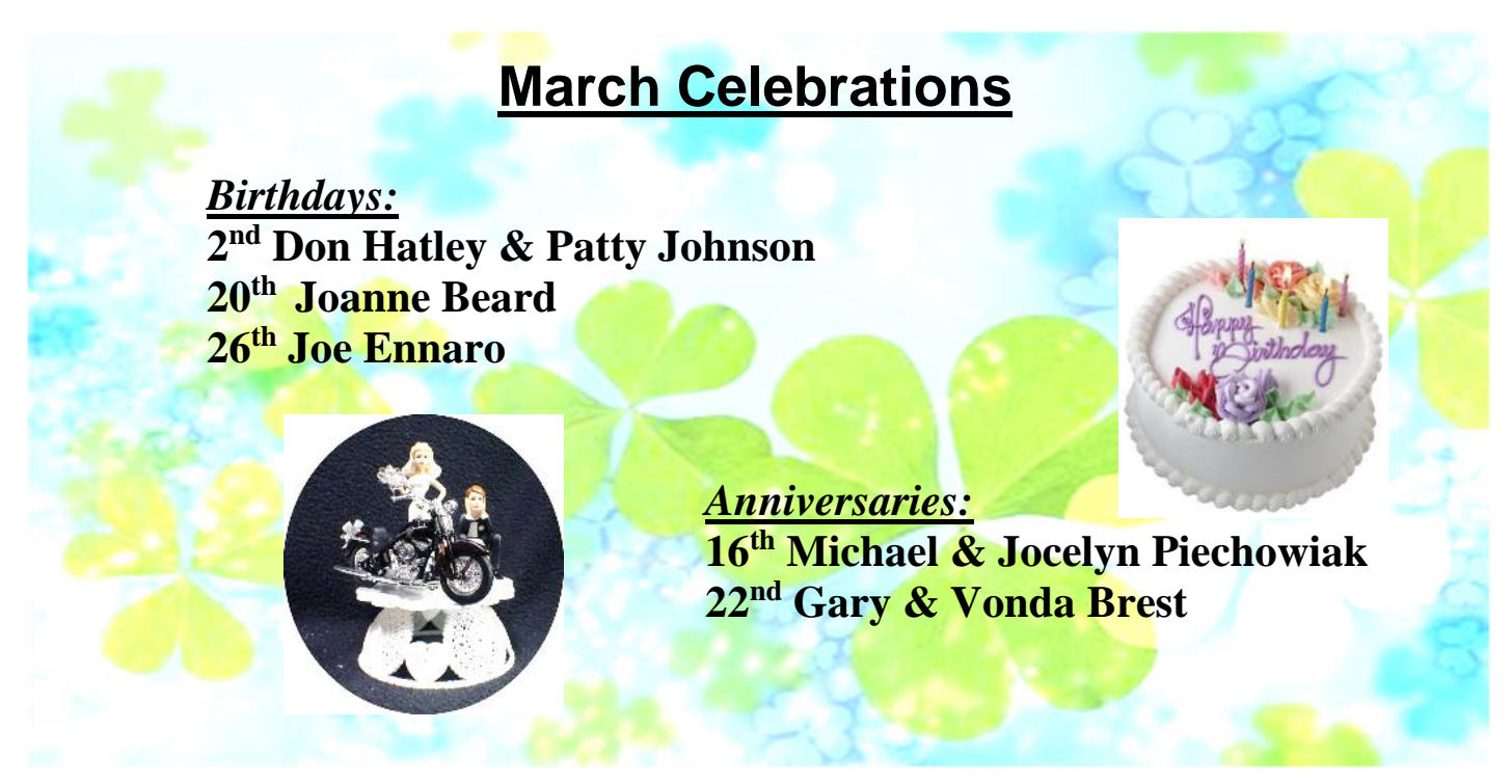
Hey "A". We would love to shout out your special days! Contact Jocelyn.