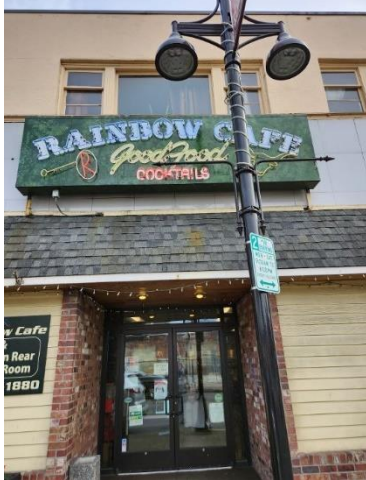
Front Entrance to Rainbow Cafe

Weather Permitting Rides after the meeting. Hope to see you there!