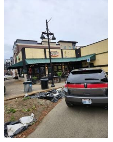
Rear entrance to Rainbow Cafe

There is limited parking in the front but plenty of parking in the back.